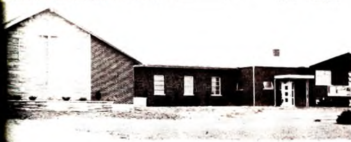
4 General Superintendent Hardy C. Powers dedicated the new church building at Grand Saline, Texas. The church is one of the oldest on the district, having been organized in 1910. A frame building