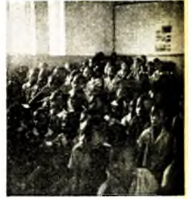
Left: Herrick Memorial Church of the Nazarene at Chilenje Location. Right: One of the Nazarene Scripture classes in a government school in Northern Rhodesia.

rene churches in every one of these Bantu locations. Branch Sunday schools, vacation Bible schools, religious education classes in the day schools should be reaching thousands of boys and girls with the gospel before they get out into sin. The opportunities in these thickly populated areas around the cities are unlimited. Our lack is trained personnel: missionaries, pastors, Sunday school teachers. Our lack is finances to put these workers into the locations and keep them there.